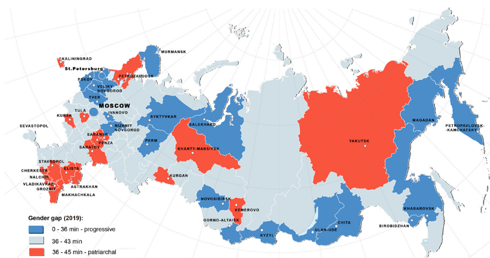
Figure 3. Weighted average values of gender gaps in the constituent entities of the Russian Federation.

In the first model, we considered the average age of women at birth of the first child by region. We chose the variable to test the hypothesis about differences in the time distribution in the constituent entities of the Russian Federation due to sociocultural features. The smaller this parameter, the more likely the prevalence of traditional attitudes in the region.