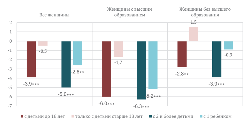
Figure 3. The amount of the "motherhood penalty", as a percentage of the wages of childless women. Estimates based on the log-linear model of wage dependence amended for the selection into motherhood

Note: *** — the differences are significant at the 0.01 level, ** — at the 0.05 level