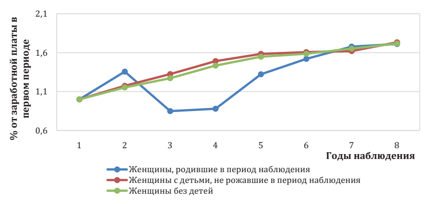
Figure 4. Wage trends of childless women and women with children, including those born in the third year of observation