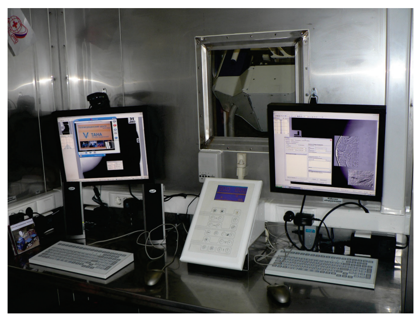
Picture 3. Digital diagnostic equipment for a mobile telemedicine complex