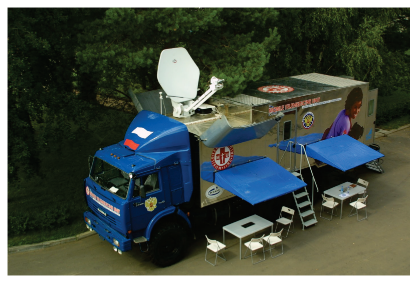
Picture 2. Appearance of mobile telemedicine laboratory and diagnostic complex